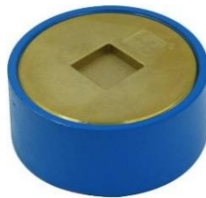
Cleanout with Brass Cover

6.5.3. The cleanout located inside the building shall be placed on the flooring level and provided with a brass cover. Additionally, use PVC cover for cleanout located outside the building.