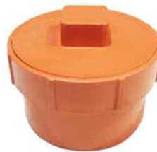
Cleanout with PVC Cover