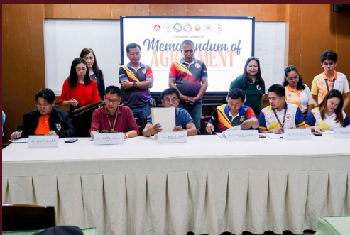
CCLGSPD Director vows to assist basic units of gov't