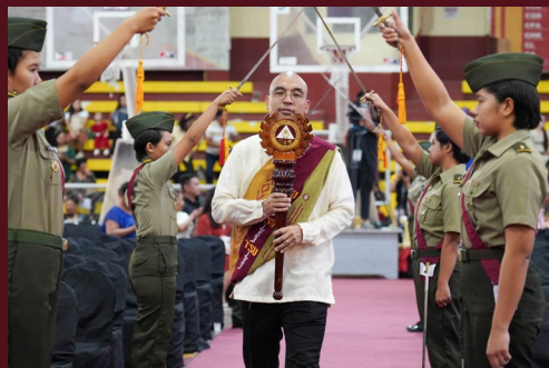
Tarlac City gov't accountant to January grads: 'You hold the power to write your story'