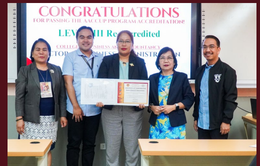
CBA's lone doctoral program reaches Level 3 AACUP re-accreditation